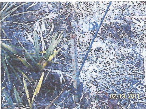
1. Steel Post driven in the Ground

Many clubs are or have been using steel posts to anchor shooting stands and feeders from being pushed over by heavy winds (See photo 1 attached). The practice of using these steel posts to anchor stands is not unsafe, but when stands or feeders are moved to different locations the steel posts are left sticking out of the ground. This practice of leaving the steel posts sticking one to two feet above ground is causing damage to logging and site prep equipment. Typically these steel posts are a color that blends in with forest floor or grassy food plots. There is a more acceptable practice that uses an anchor that is screwed in the ground under the stand or feeder and can be taken out when the stand or feeder is moved (See attached 2 photo). This year Hancock Forest Management is asking hunting clubs to discontinue using these steel t-posts to anchor stands and feeders and begin using the safer method of anchoring stands or feeders. If your club is currently using these steel posts for anchors, we ask that you remove them from the ground. This year we are asking for voluntary compliance with this safety issue, but clubs should be aware that this may become part of their yearly license with potential for cancellation of the lease if the club fails to comply. Thank you for your help and have a safe hunting season.